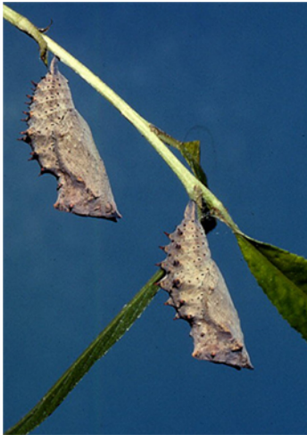
Mourning Cloak Chrysalises