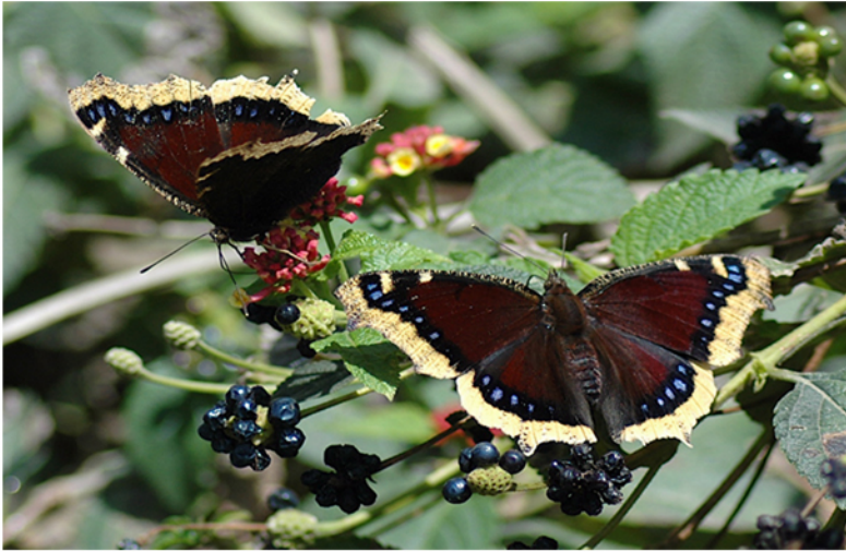
Mourning Cloaks Nectaring on Lantana