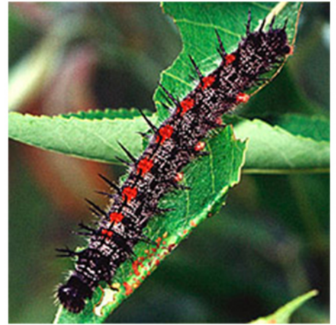
Mourning Cloak Caterpillar